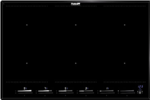
TABLE CUISSON INDUCTION PUNTO - NOIR 77x52 6 ZONES